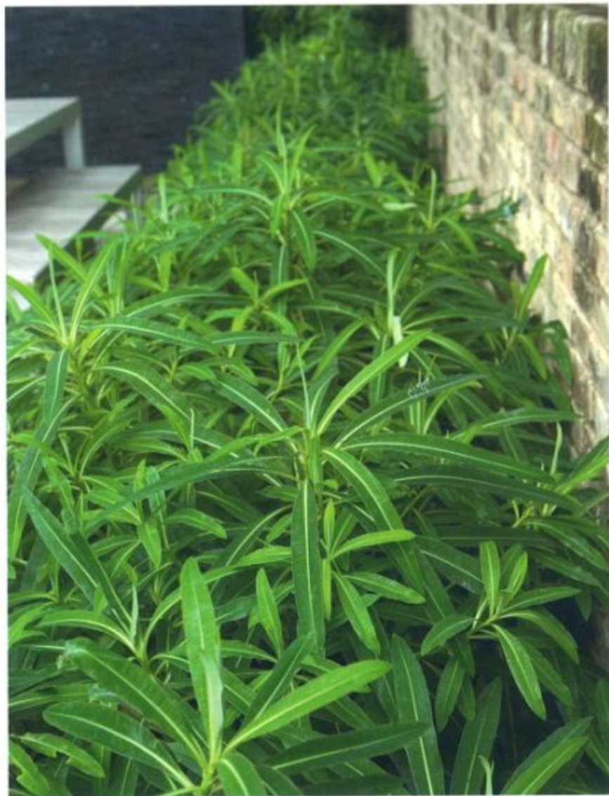
▲ If you want simple and you want style, use a single line of plants. Choose something like this euphorbia which will look good all through the year.