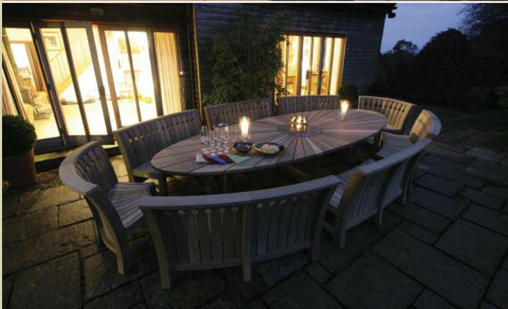
TABLE TALK Gaze Burvill's oval oak Broadwalk table and seating is designed to seat a crowd. www.gazeburvill.co.uk