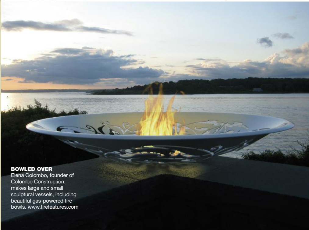
BOWLED OVER Elena Colombo, founder of Colombo Construction, makes large and small sculptural vessels, including beautiful gas-powered fire bowls. www.firefeatures.com

satellite speakers and powerful in-ground subwoofers, which are important because there is no structure to contain the bass as there would be in an internal zone. This arrangement allows an even distribution of high-definition sound, as opposed to the uncomfortable noise that can be generated from a large single pair of speakers.' But what about the neighbours? 'By using directional satellite speakers installed in the correct locations, we can significantly reduce the noise pollution,' says Wilkin.