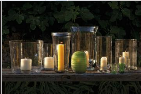
NEW FLAMES Light up the night with Marston & Langer's hurricane lamps. www.marston-and-langer.com