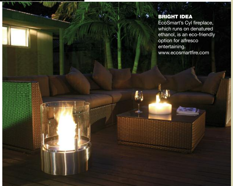
BRIGHT IDEA EcoSmart's Cyl fireplace, which runs on denatured ethanol, is an eco-friendly option for alfresco entertaining. www.ecosmartfire.com