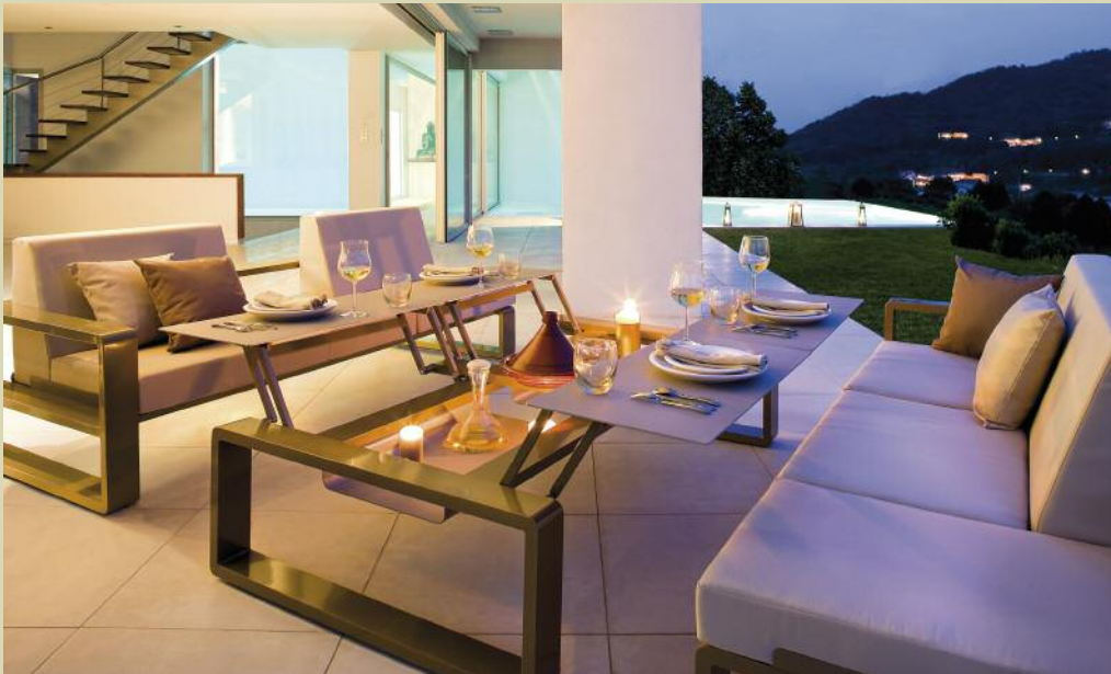
KAMA CHAMELEON Ego's chic Kama range offers flexible seating and dining combinations. www.leisureplan.co.uk