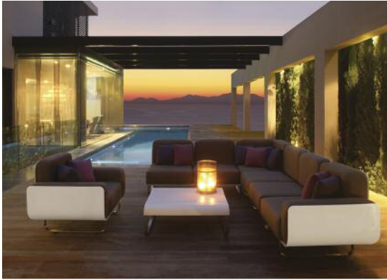
OCEAN COLOUR SCENE Indian Ocean's Fold sofa collection features shaped acrylic plates on shiny electro-polished steel bases, which blend contemporary materials with a retro design aesthetic. www.indian-ocean.co.uk