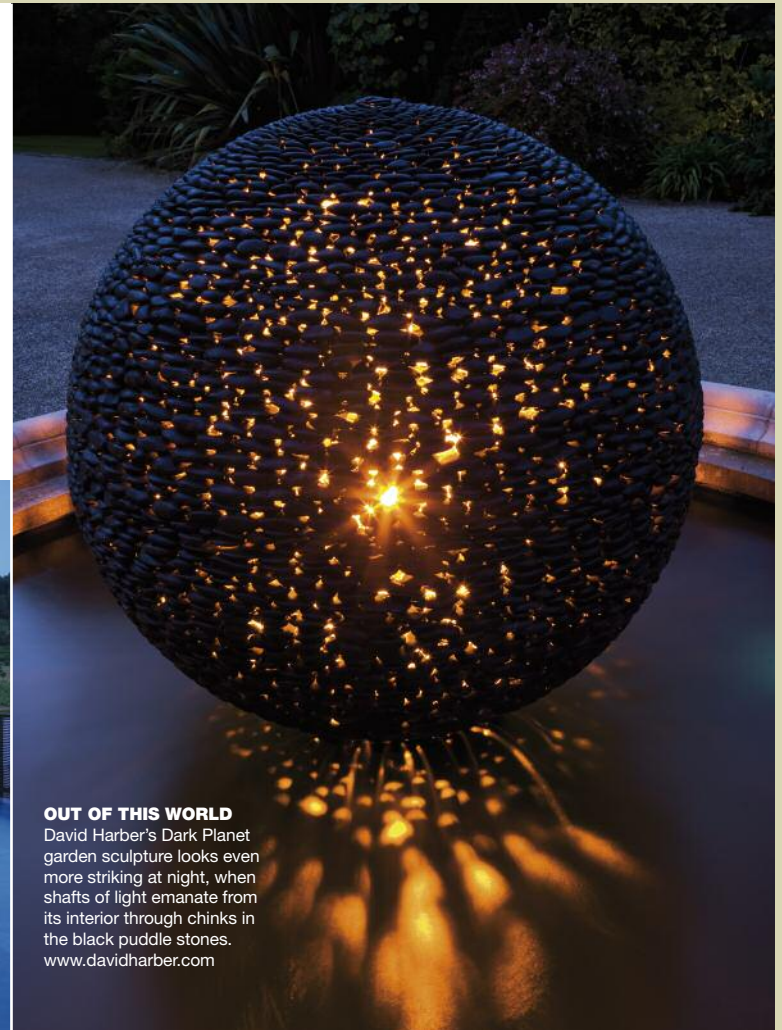
OUT OF THIS WORLD David Harber's Dark Planet garden sculpture looks even more striking at night, when shafts of light emanate from its interior through chinks in the black puddle stones. www.davidharber.com

is overlooked but, at the same time, still let as much light down into the area as possible,' says Trevor. 'City gardens can be shady because of the surrounding buildings. Check where the sun shines and shadows fall during the day and into the evening, then choose the best location for the planting and seating areas.'