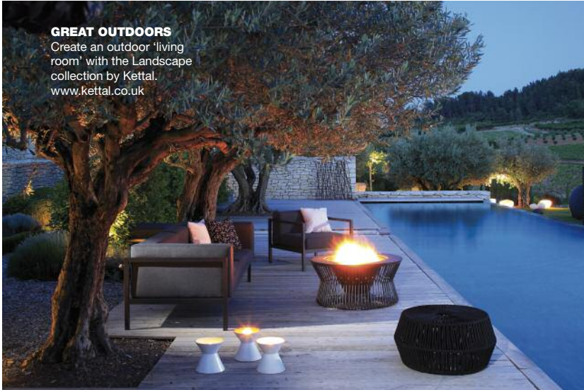
GREAT OUTDOORS Create an outdoor 'living room' with the Landscape collection by Kettal. www.kettal.co.uk